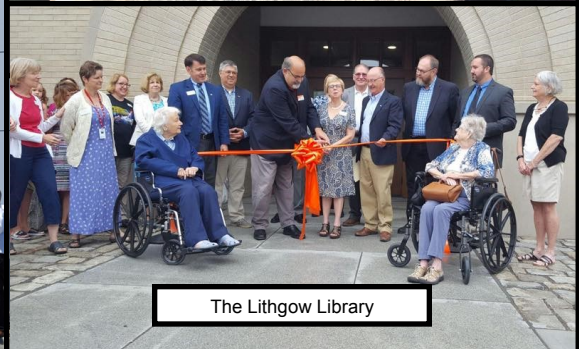
The Lithgow Library