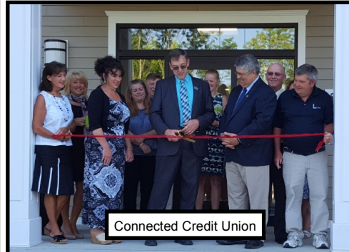
Connected Credit Union

Over the last few months, we have had the fantastic pleasure of highlighting the growth of new and established businesses throughout our region. Here are a few of the ribbon cuttings and ground breakings that we have celebrated. It's a great time to do business in the Kennebec Valley!