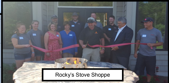
Rocky's Stove Shoppe