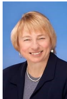
Janet Mills Democrat