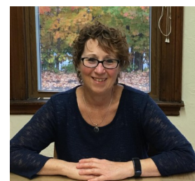
Melody Fitch Family Violence Project