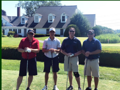
1st Place - Low Gross