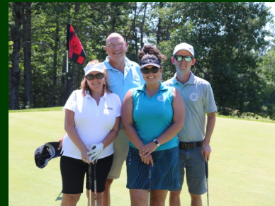
1st Place - Low Net

Thank you to our generous sponsors, volunteers and teams!