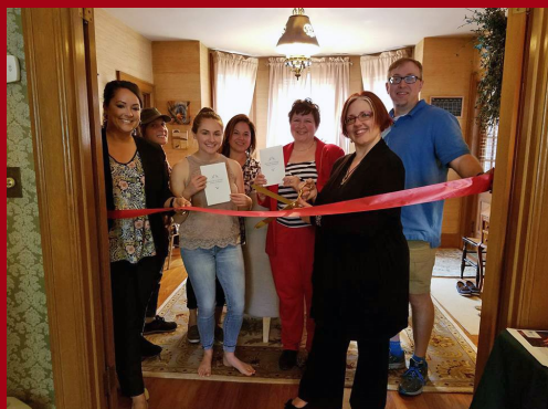
Zardus Art of Massage - School of Massage