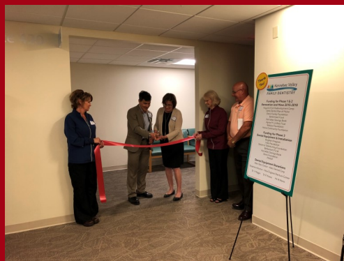
Kennebec Valley Family Dentistry